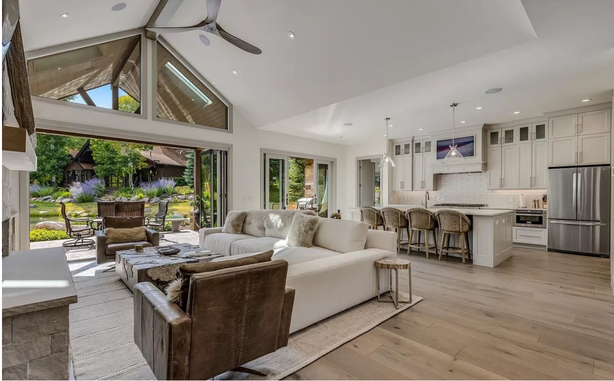
Custom home completed in 2023, Carbondale, CO

The IPOA Resident Engagement Committee would like to feature your business! Please email communications@ironbridgepoa.com if you would like to be considered. Limited to businesses located in the Roaring Fork Valley and owned by current Ironbridge residents. Thank you!